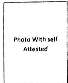
Photo With self Attested